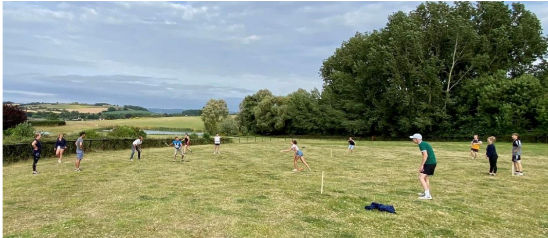
Racing Welfare rounders and BBQ evening at Sandhill Racing Stables