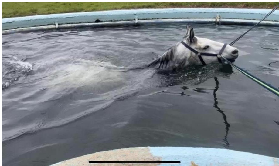
Keeping cool in the Equine swimming pool