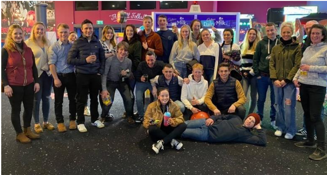
Team bowling in Taunton