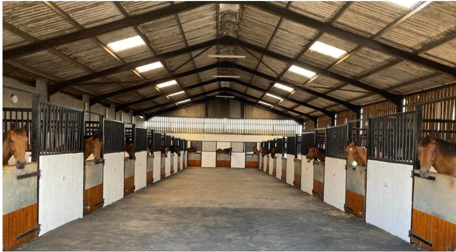
Horses back in their stables and back to work.