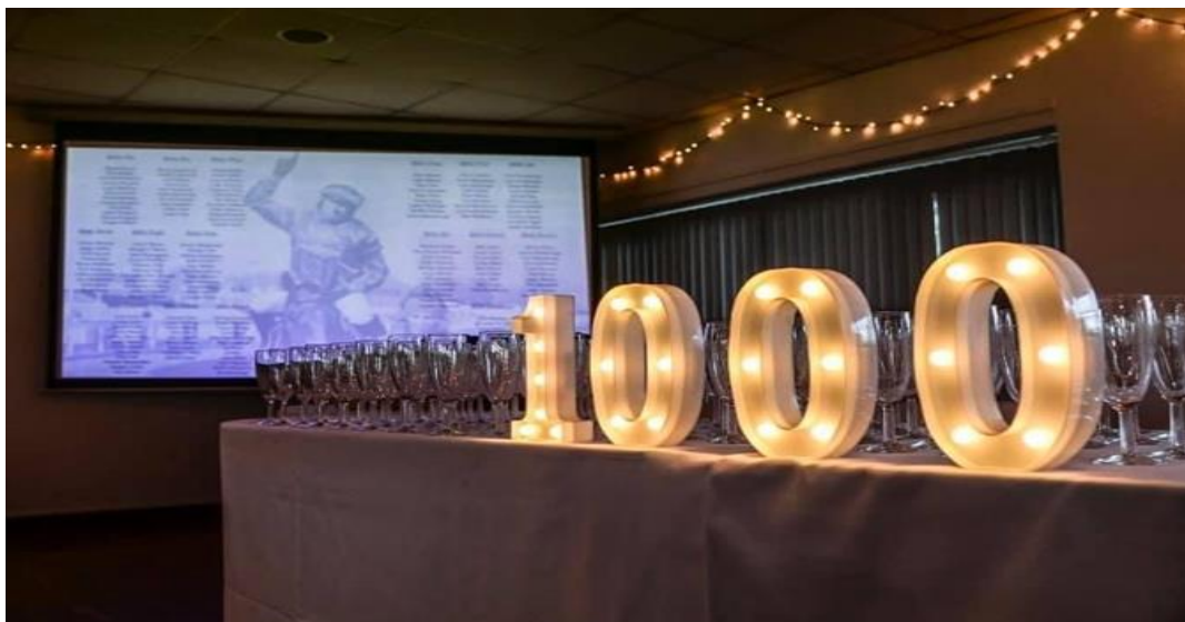
Tom O'Brien's 1,000 winner's party