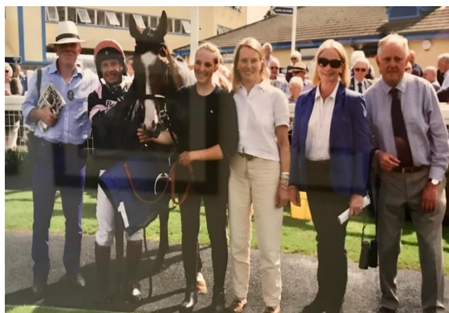
Figure 1 Leapaway