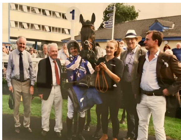
Figure 2 Majestic Touch