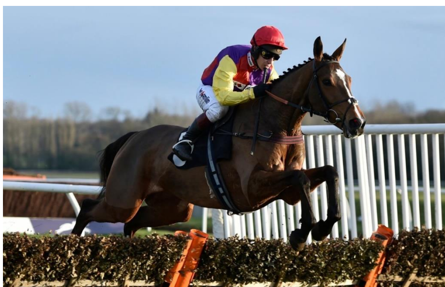
Figure 7 Tidal Flow