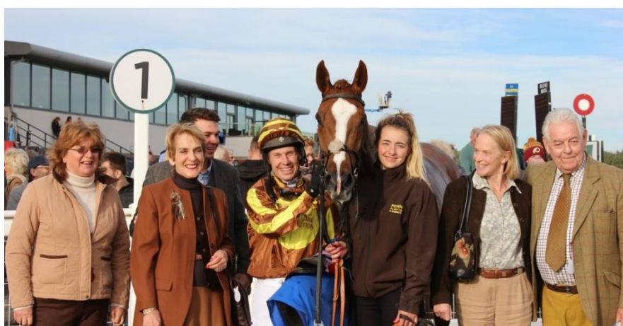
Figure 3 Earth Moor

New Millennium (By Galileo) is a horse that can be very strong at home and in his races, but it was great to see him win the next day at Fontwell, under a positive ride from the champion jockey.