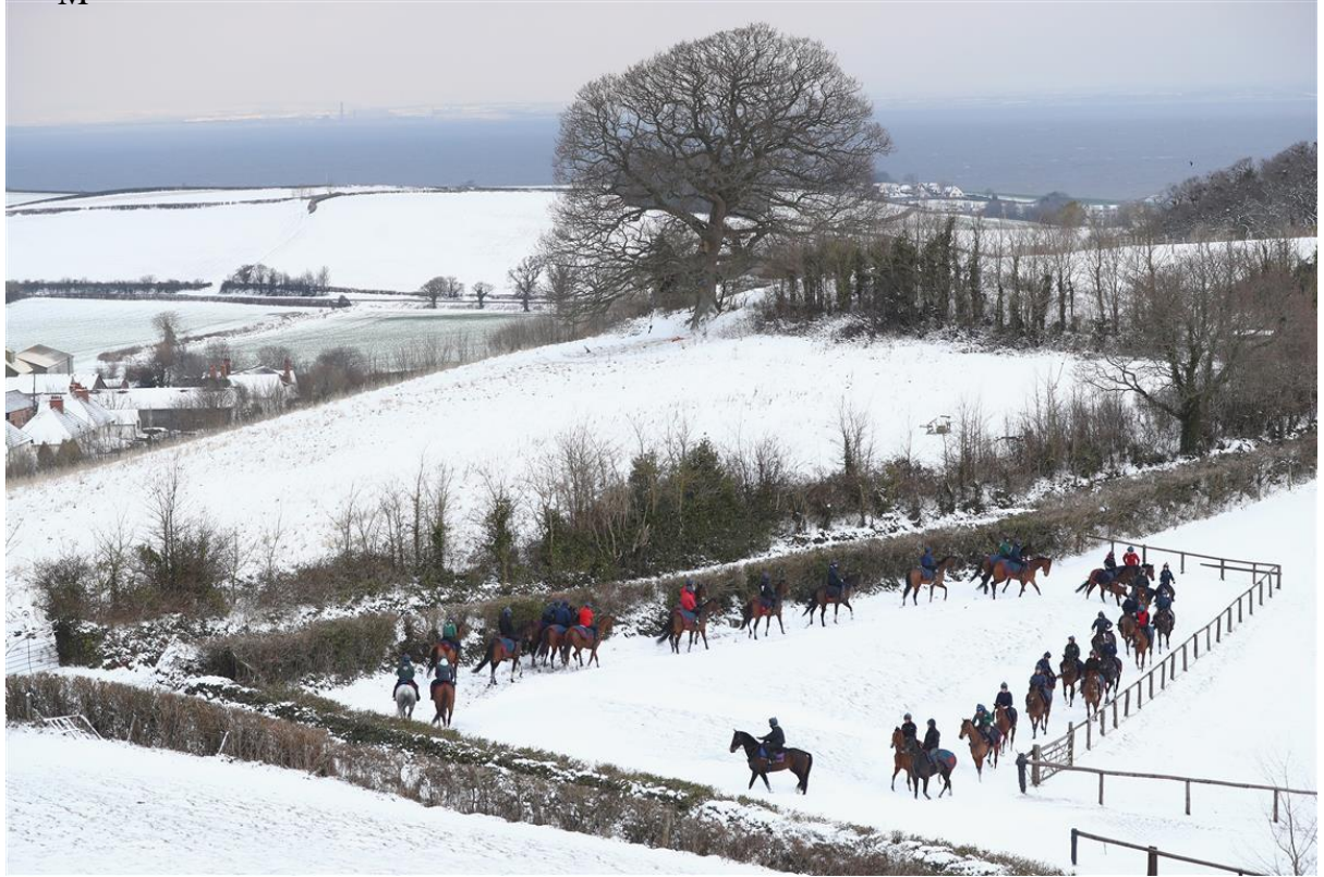
Figure 8 Sandhill in the snow March 2018