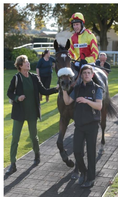
Figure 2 New Millennium