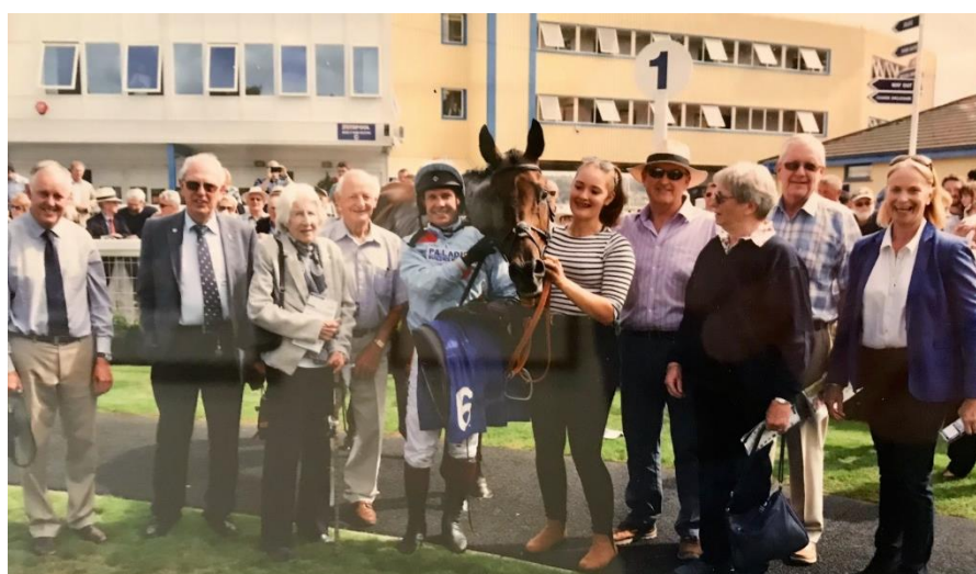
Figure 1 Roll The Dough