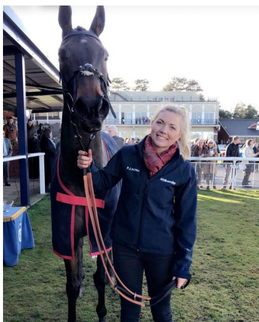
Figure 5 Oakley

December was finished off with a fun Christmas party for all the staff at the local pub, to thank them for all their hard work, especially during the festive season.