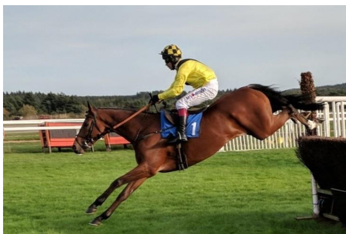
Figure 4 Sternrubin